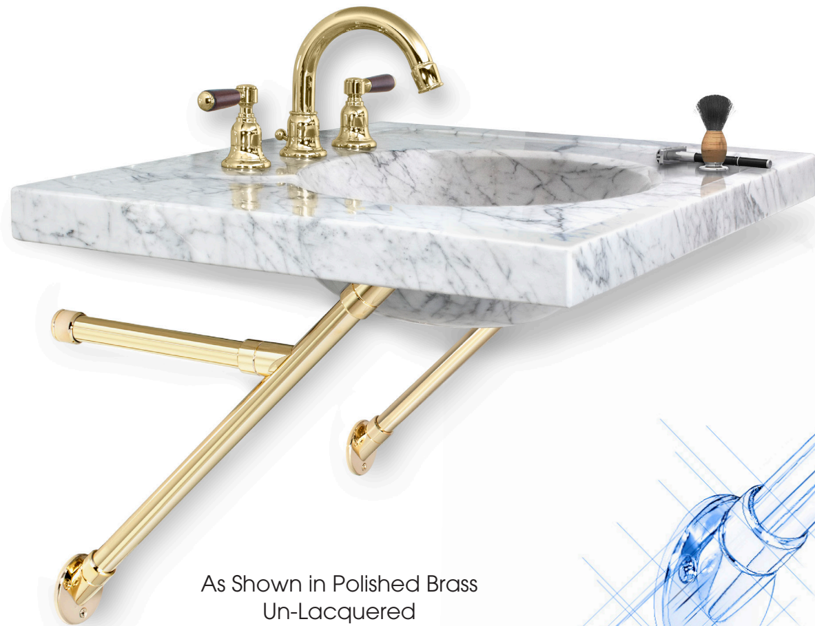
As Shown in Polished Brass Un-Lacquered