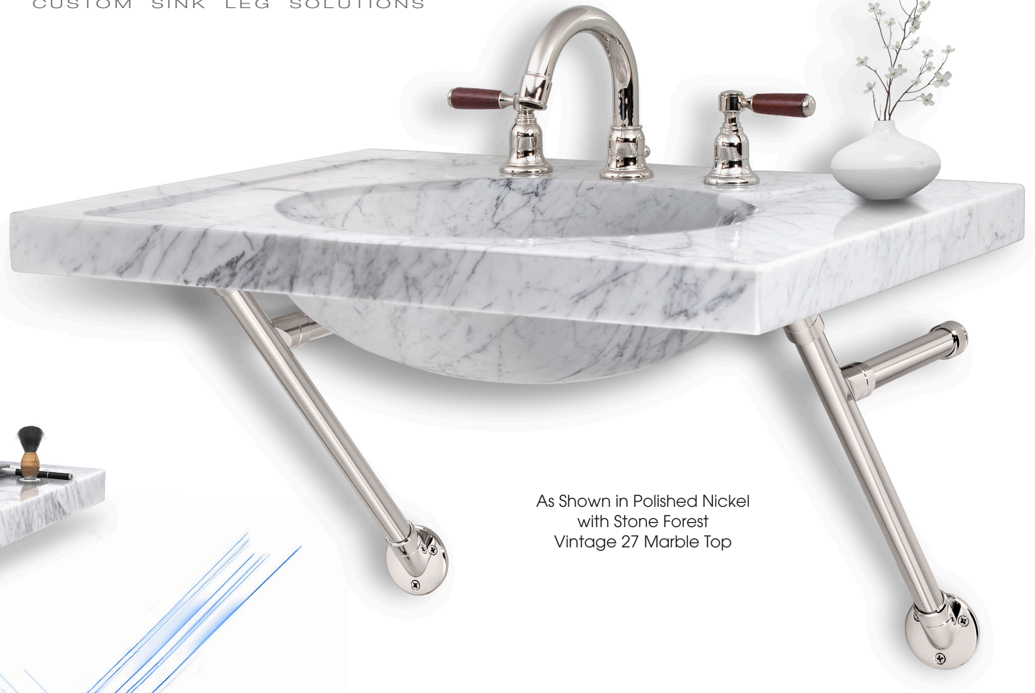
As Shown in Polished Nickel with Stone Forest Vintage 27 Marble Top