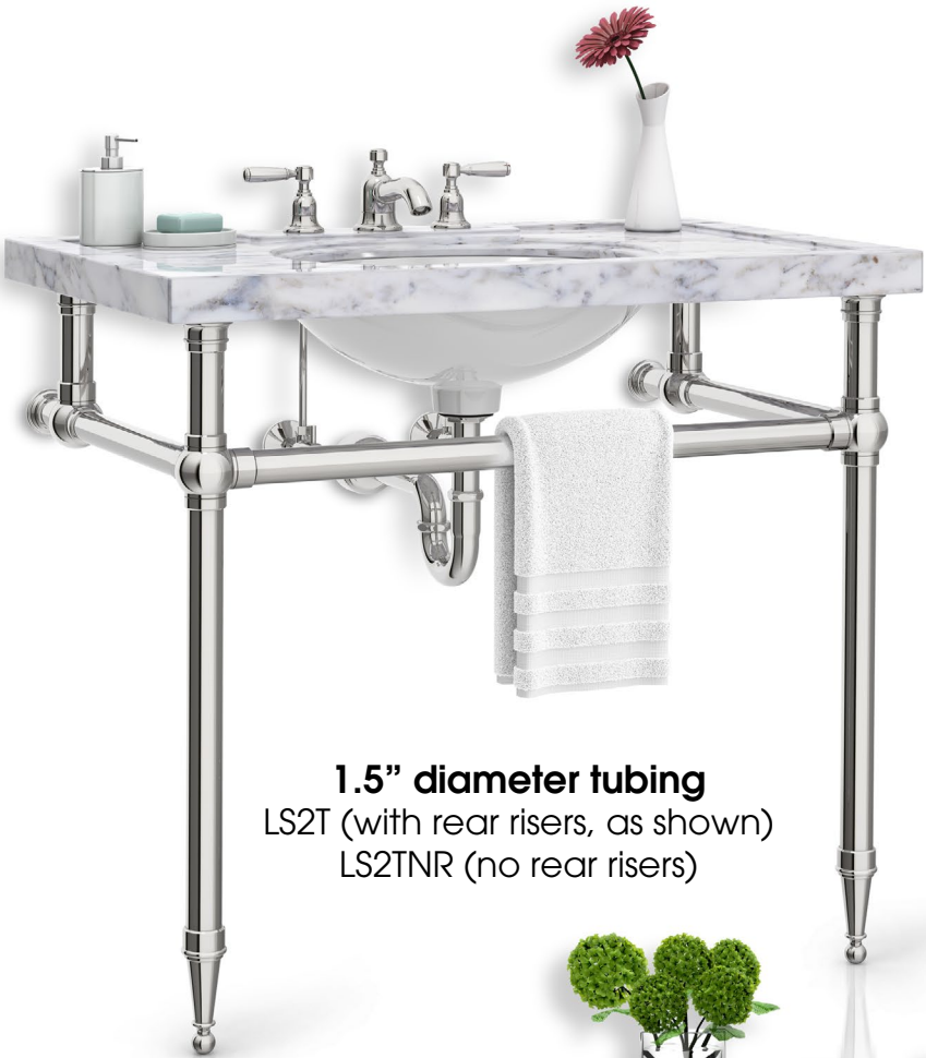
1.5" diameter tubing LS2T (with rear risers, as shown) LS2TNR (no rear risers)

Dimensions: Standard leg size only: 32" w x 22" d x 32" h Leg Systems can be field cut to reduce size