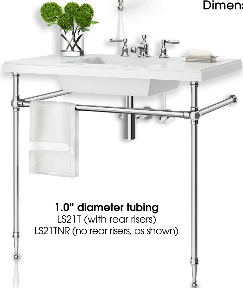
1.0" diameter tubing LS21T (with rear risers) LS21TNR (no rear risers, as shown)