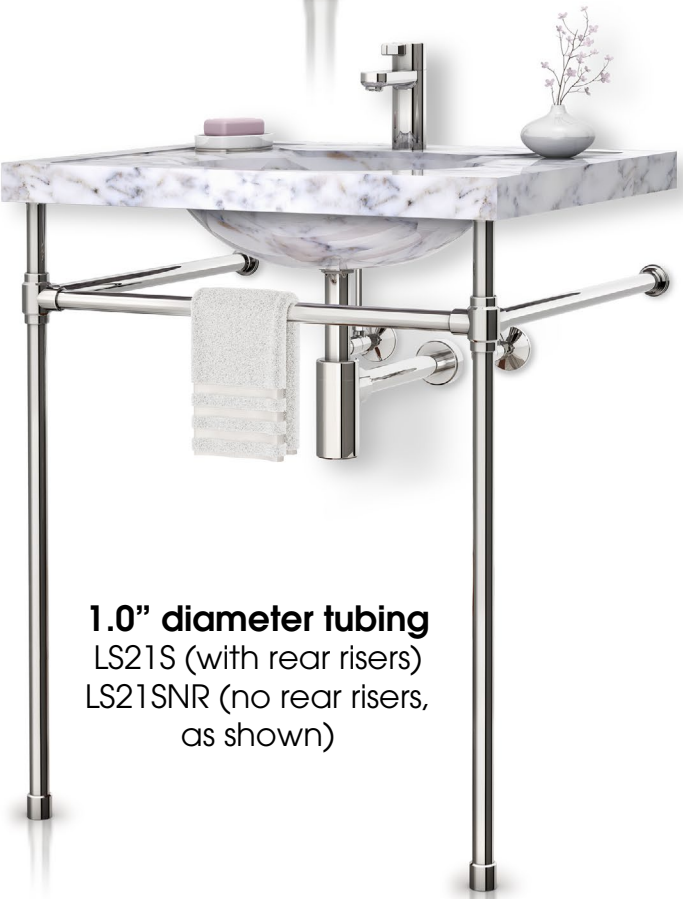
1.0" diameter tubing LS21S (with rear risers) LS21SNR (no rear risers, as shown)