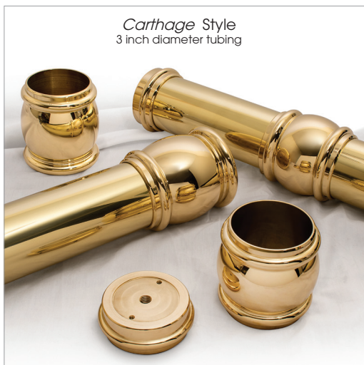
Carthage Style 3 inch diameter tubing