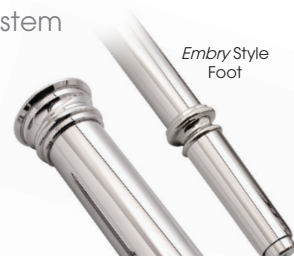
Embry Style Foot