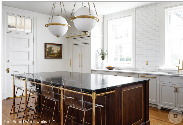
Four Board Woodworks, LLC

Palmer Industries is a Boutique Designer & Manufacturer of Custom Architectural Metalwork