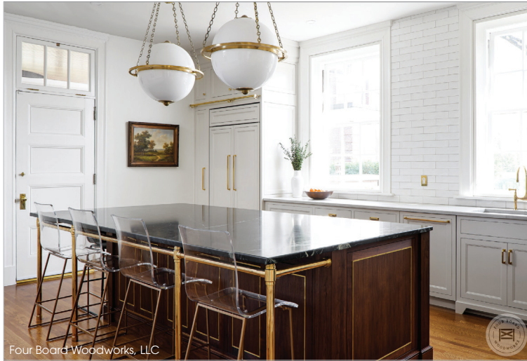
Studio Style in Un-Lacquered Polished Brass

Palmer Industries is a Boutique Designer & Manufacturer of Custom Architectural Metalwork