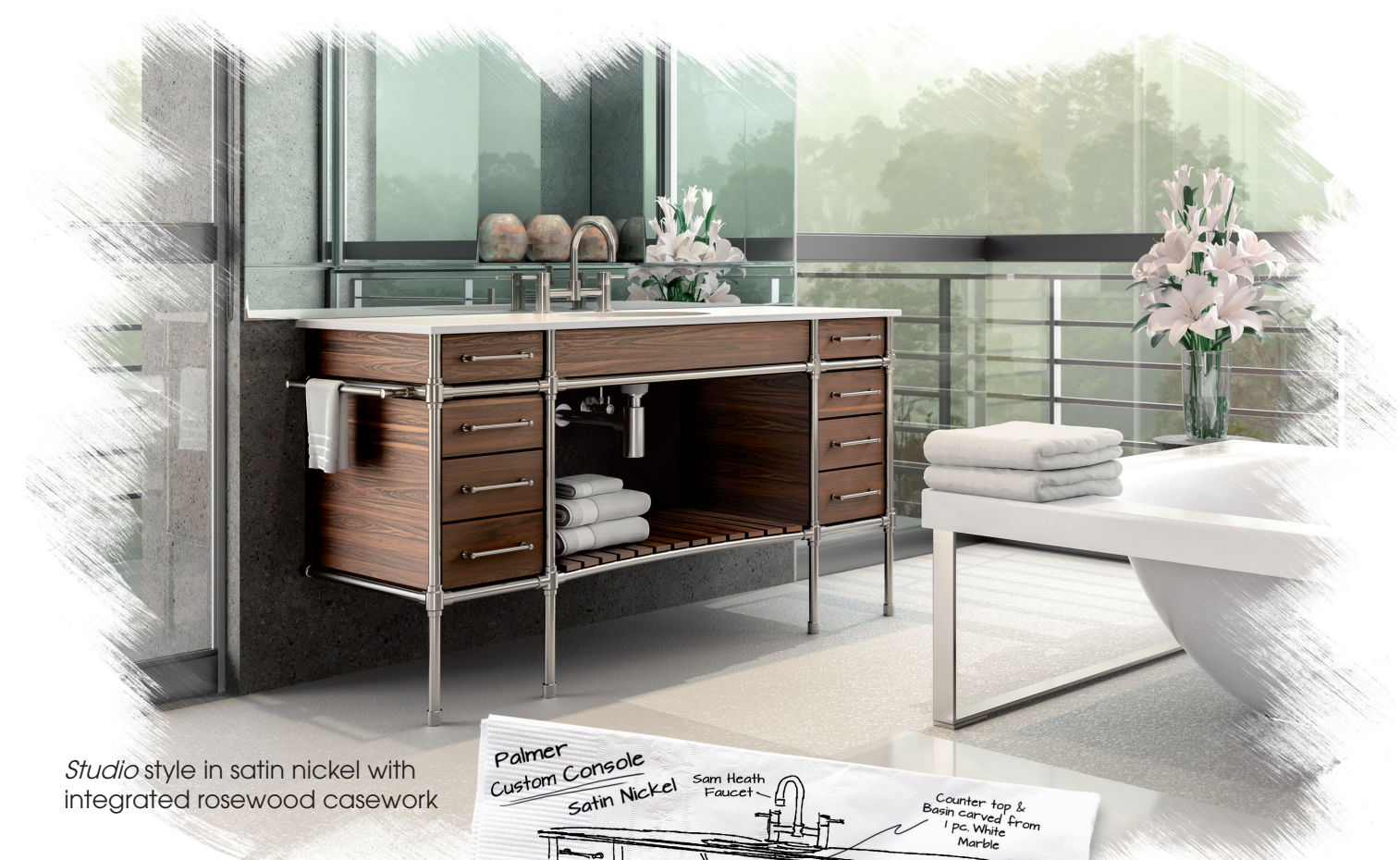
Studio style in satin nickel with integrated rosewood casework