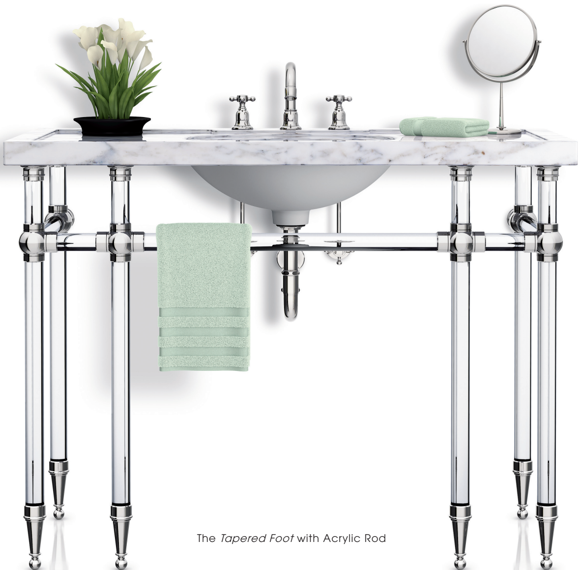
The Tapered Foot with Acrylic Rod