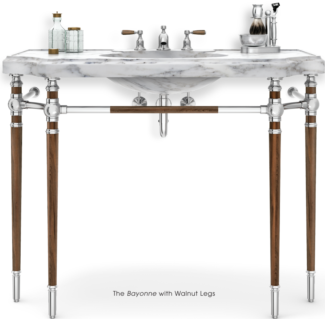
The Bayonne with Walnut Legs