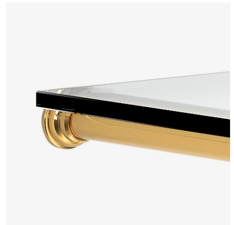
Ball Style with Ceiling & Wall Mount