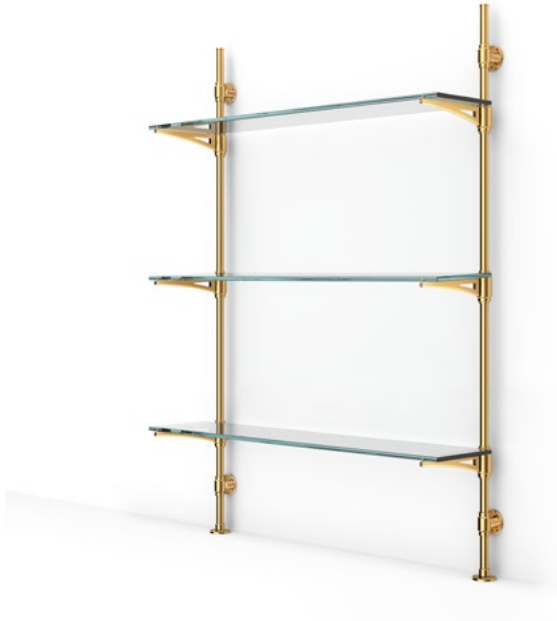
Counter & Wall Mounts