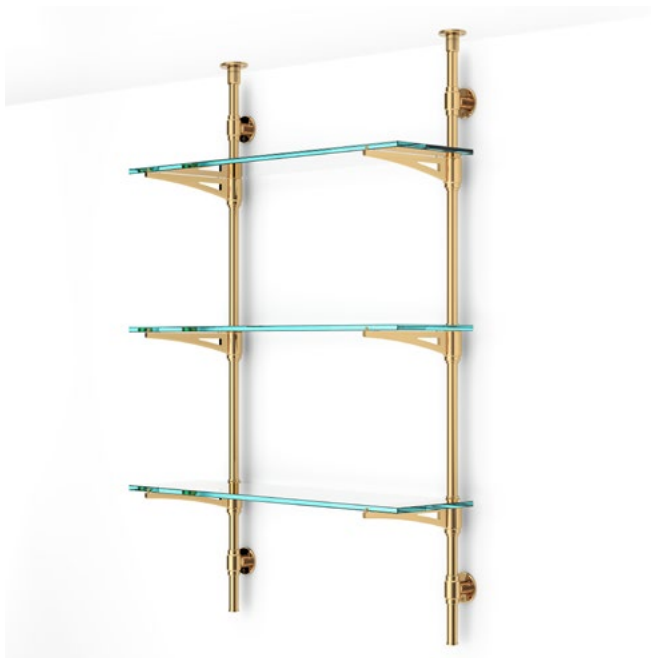
Ceiling Mounts Attachments to Wall