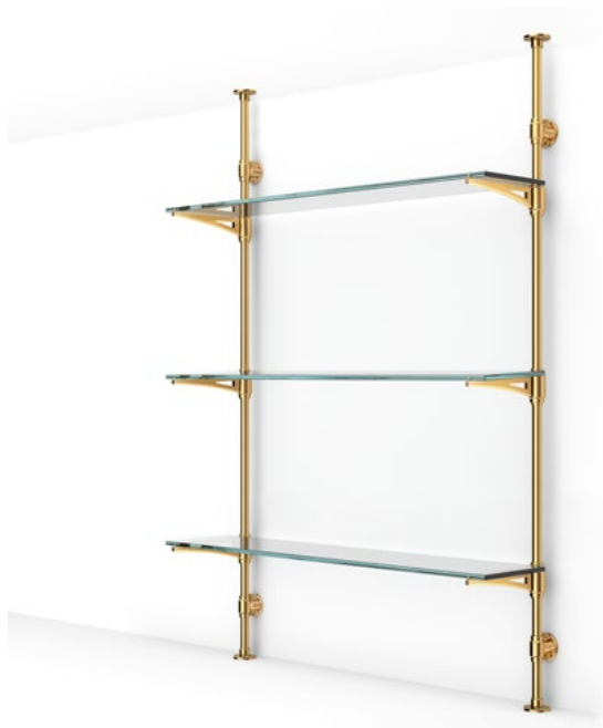
Counter, Wall, & Ceiling Mounts