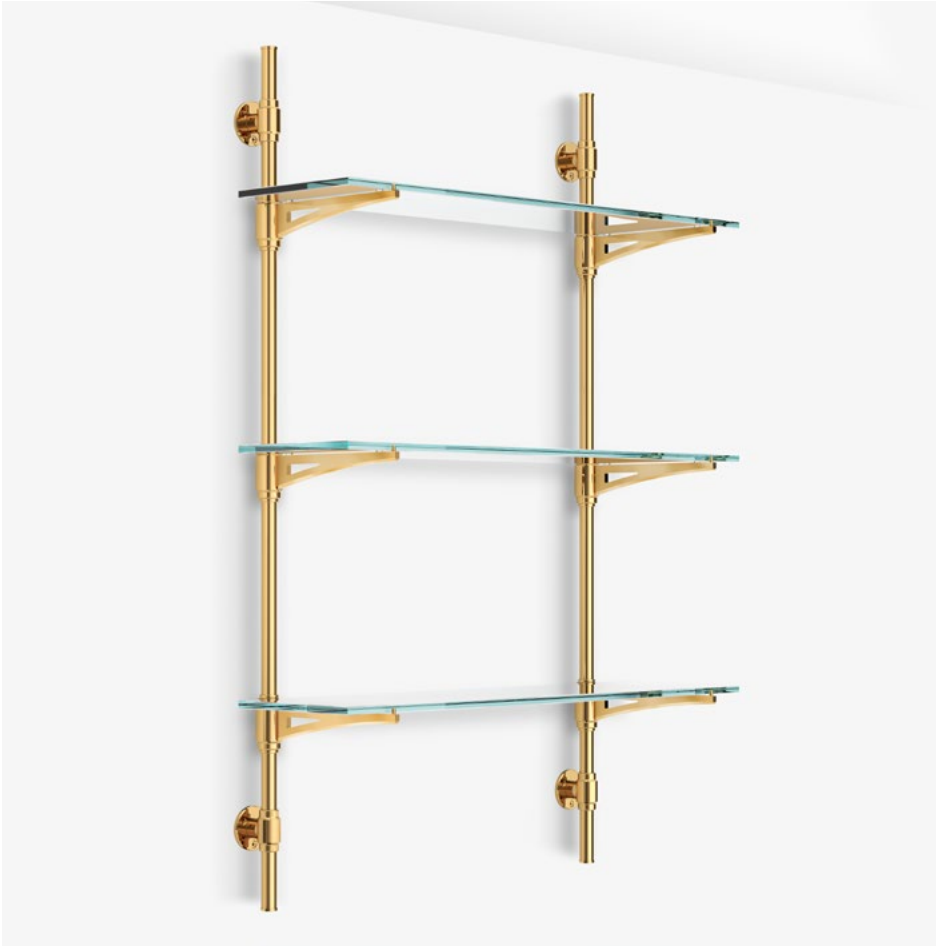
Rack Style with Wall Mount