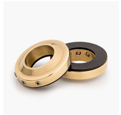
Split Collar Style with Ceiling Mount