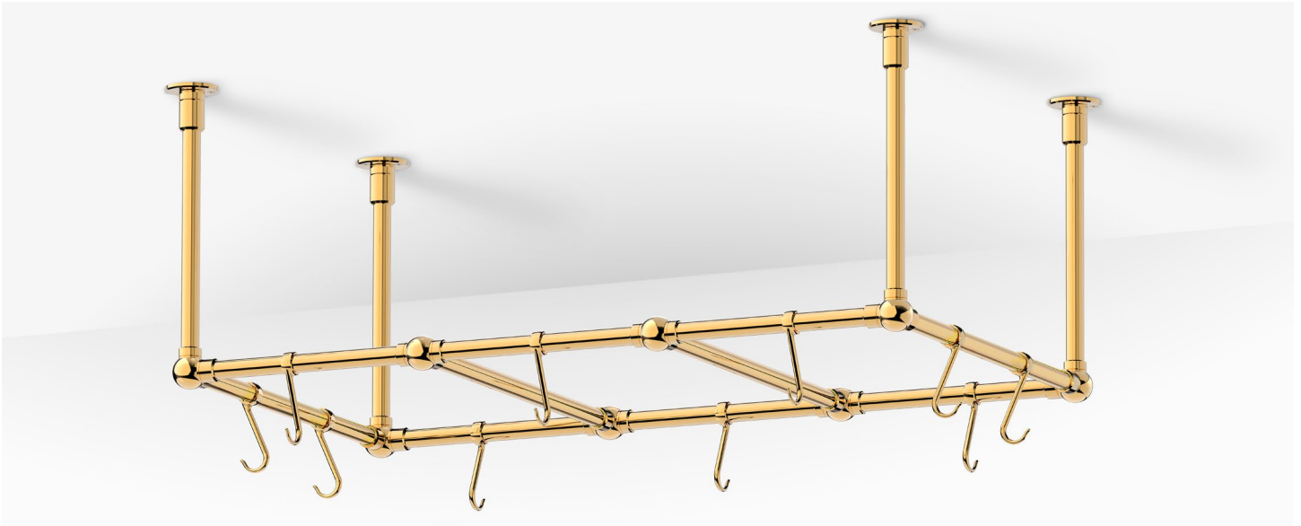
Ball Style Pot Rack with Corner Mount Posts and Mid-Bars